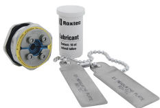
C RS T Ex seal